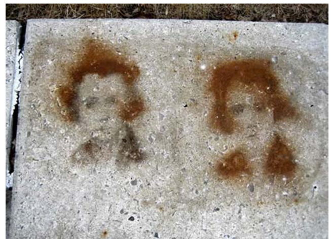
Fig. 4 Rachel Carson "clones" drawn in iron filings from a single template ( http://www.BU.edu/Darwin )