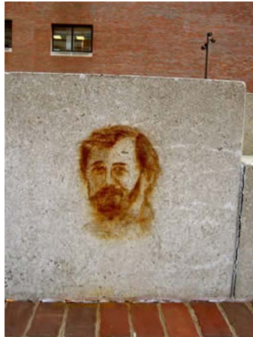
Fig. 9 Niles Eldredge

Ronald Fisher b. London, England, Feb. 17, 1890, d. 1962, graduated from college at Cambridge in 1913 where he got hooked on eugenics, a lifelong prejudice. He is famed as a statistician, evolutionary biologist, and geneticist. Known with Sewall Wright and J.B.S Haldane for work on the modern evolutionary synthesis, his contributions to population genetics are still important. Fisher also