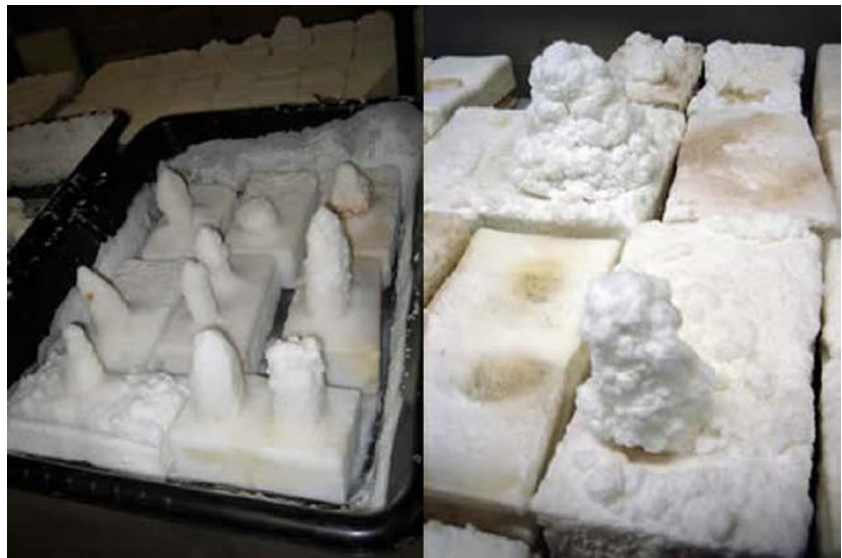
Fig. 2 Salt blocks formed in the artist's studio ( http://www.BU.edu/Darwin )

fully under the artist's control. The experiment succeeded. In January, NAGA Gallery opened a show that featured a lovely, pink-tinged image of a woman's head entitled "Duchess of Portland," rendered in mud and hummingbird nectar on Kochi paper (Fig. 3). "I've never heard of anybody that had a domestic hummingbird," Solondz marvels.