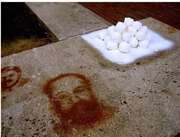
Fig. 8 Daniel Dennett