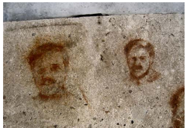
Fig. 10 Stephen Jay Gould

Asa Gray b. Nov. 18, 1810, Paris, NY, d. 1888, was the foremost American botanist of his day and Darwin's first, strongest supporter in the United States. Working at a time when the nation's flora was mostly unclassified, Gray wrote defining taxonomies, textbooks, and guidebooks. It was his interest in and knowledge of plant distributions that sparked a sustained correspondence with Darwin who later produced a copy of a letter to Gray in proof of his claim to have discovered the idea of natural selection before Alfred Russel Wallace. In spite of his evangelical Protestant faith, Gray had no problem reconciling his Darwinism with a profound rejection of atheism.