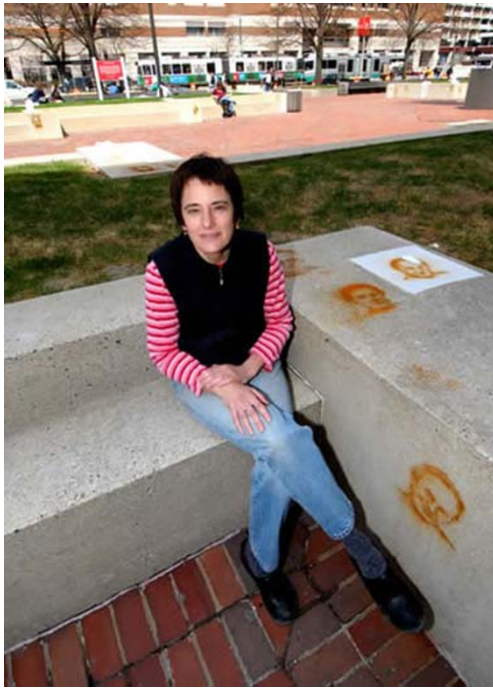
Fig. 1 The artist beside images of Richard Dawkins ( http://www.BU.edu/Darwin )

gamin build, her light laugh, and quick smile make her seem more like one of her own RISD photography students than the dedicated studio artist and fiftyish mother of teenagers that she is. Yet there is a spark of the scientist in her eyes: fearless intelligence and a deep spirit of inquiry that likes to follow the thread of logic.