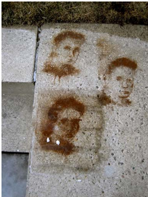
Fig. 5 "This is the third clone of Marie Curie. It is amazing to me how different each of them have come out." (quoted from the artist's blog at http://www.BU.edu/Darwin )

Charles Darwin b. Shrewsbury, England, Feb. 12, 1809 d. 1882 and was buried in Westminster Abbey to honor his discovery of natural selection as the engine of evolution, discovered earlier but only published in his famous On The Origin of Species (1859). He planned to become a minister, but his studies at Cambridge—botany with Reverend John Stevens Henslow and geology with Reverend Adam Sedgwick—prepared him for his lucky voyage of discovery in South America on the Beagle . By the time he reached the Galapagos Islands, the young naturalist was already an evolutionist, although he did not come up with the mechanism of natural selection until reading Malthus' "Essay on the Principle of Population" (Fig. 6).