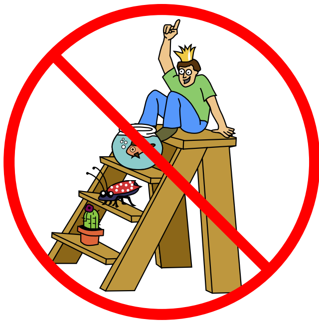
Fig. 1 Evolution is not goal directed and does not climb a ladder of progress. An organism's fitness is not absolute but is dependent on its current environment. Illustration modified with permission from the Understanding Evolution website