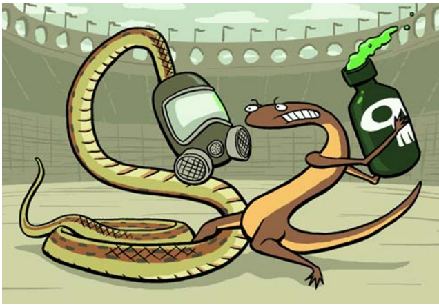
Fig. 2 The rough-skinned newt and the common garter snake are engaged in an evolutionary arms race. Illustration reproduced with permission from the Understanding Evolution website

traits vary among individuals in a population, are genetically based, and affect fitness (Brodie 1968; Brodie and Brodie 1990, 1999a; Hanifin et al. 1999; Williams et al. 2003). Then they showed that newt and snake toxicity varies across different regions but that newts and snakes living in the same region have matching levels of toxicity and resistance (Fig. 3), exactly as we would expect if newts and snakes are engaged in an evolutionary arms race that has escalated more quickly in some regions than others (Brodie et al. 2002). The researchers even figured out exactly what trade-off is at stake for the garter snakes: speed. Garter snakes with low resistance are quick—which helps them escape their predators and catch prey—and the more toxin resistance a garter snake has, the slower it moves (Brodie and Brodie 1999b). Too much resistance makes the snake pay a significant price—trouble catching food and escaping from its own predators. This compelling example provides an opportunity to help students learn important evolutionary and ecological concepts while gaining an understanding of the process of science and how biologists investigate questions about the evolutionary past using evidence they gather today (see “In the Classroom” section below for teaching resources on this example).